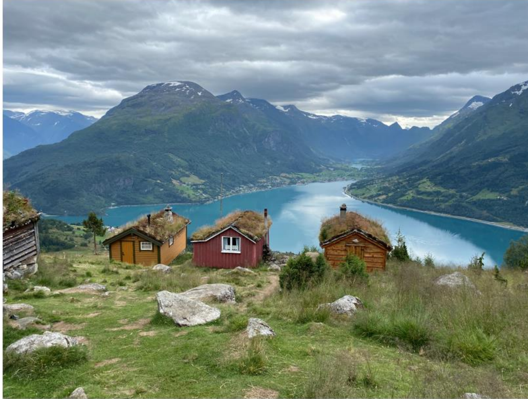
Raksetra (hiking) (in Loen)